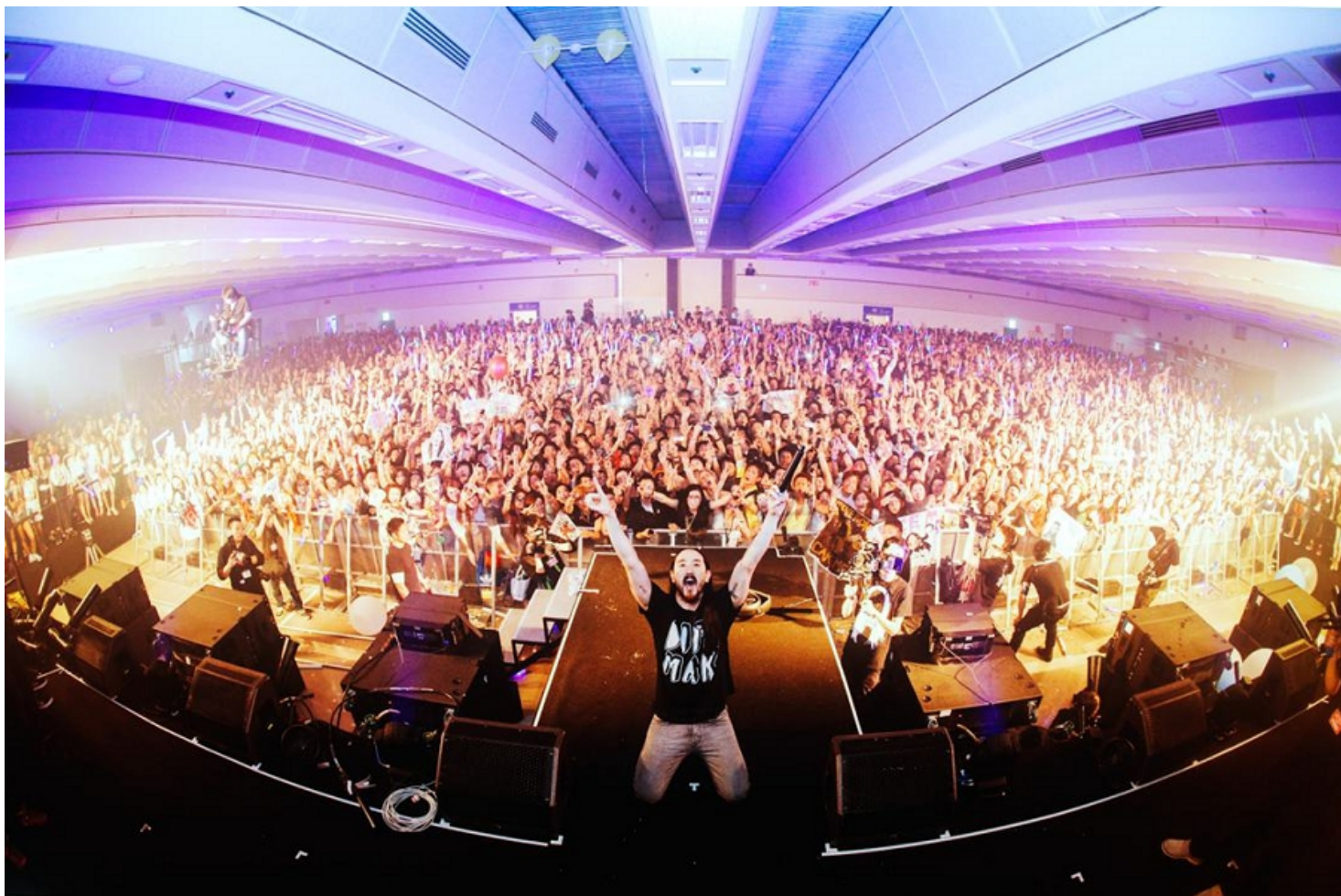
DJ Steve Aoki performing at MUSIC CIRCUS organized by TryHard at Kobe International Exhibition Hall in Hyogo, Japan