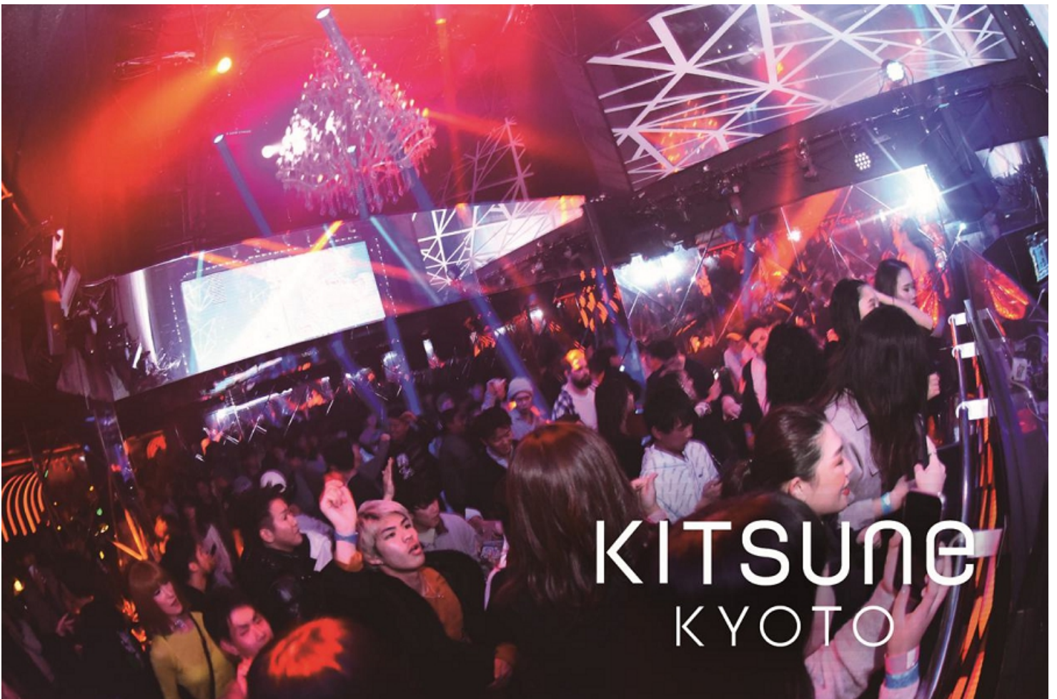
Crowd enjoying a weekday night at Kitsune club managed by TryHard in Kyoto, Japan