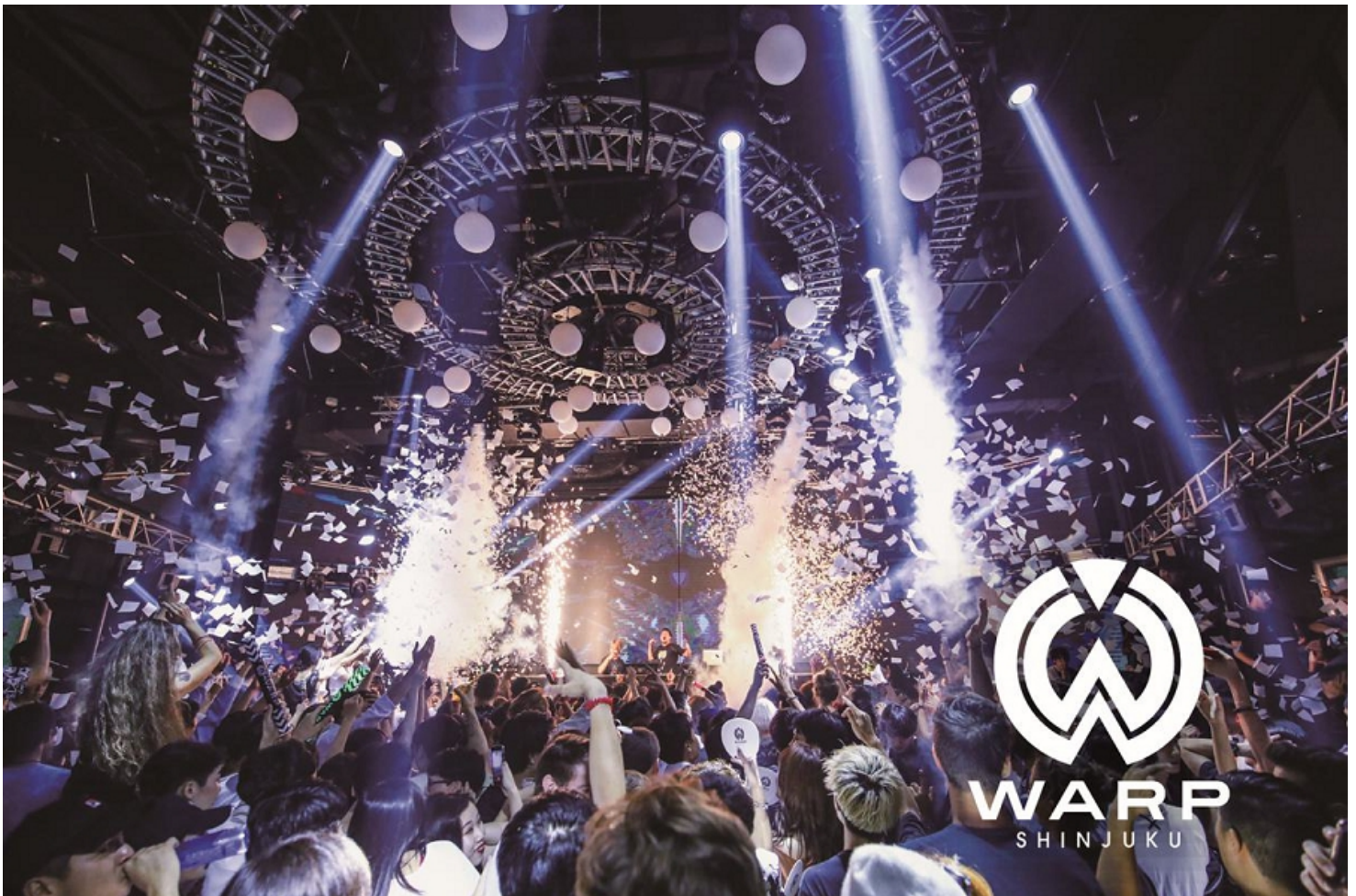
A Saturday night at Warp Shinjuku club in Tokyo, Japan managed by TryHard

Images of typical crowds at our managed night clubs: