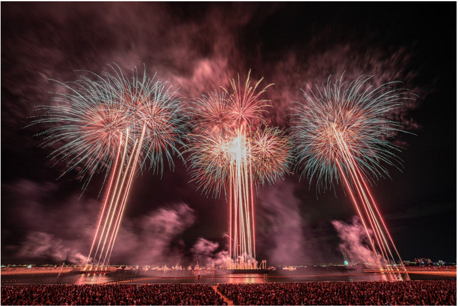
Firework show from Senshu Yume Hanabi (Senshu Dream Fireworks), organized by TryHard in August 2024