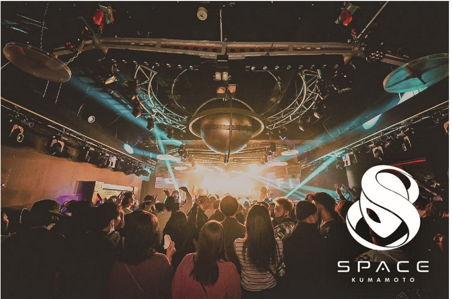
A typical weekend night at Space club managed by TryHard in Kumamoto city, Japan