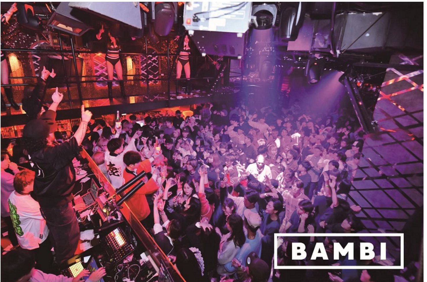
DJ interacting with the crowd at Bambi club managed by TryHard in Osaka, Japan