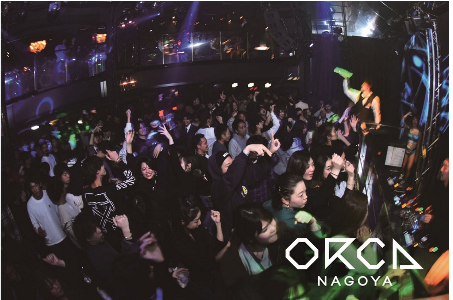
A typical Friday night at Orca club in Nagoya, Japan managed by TryHard