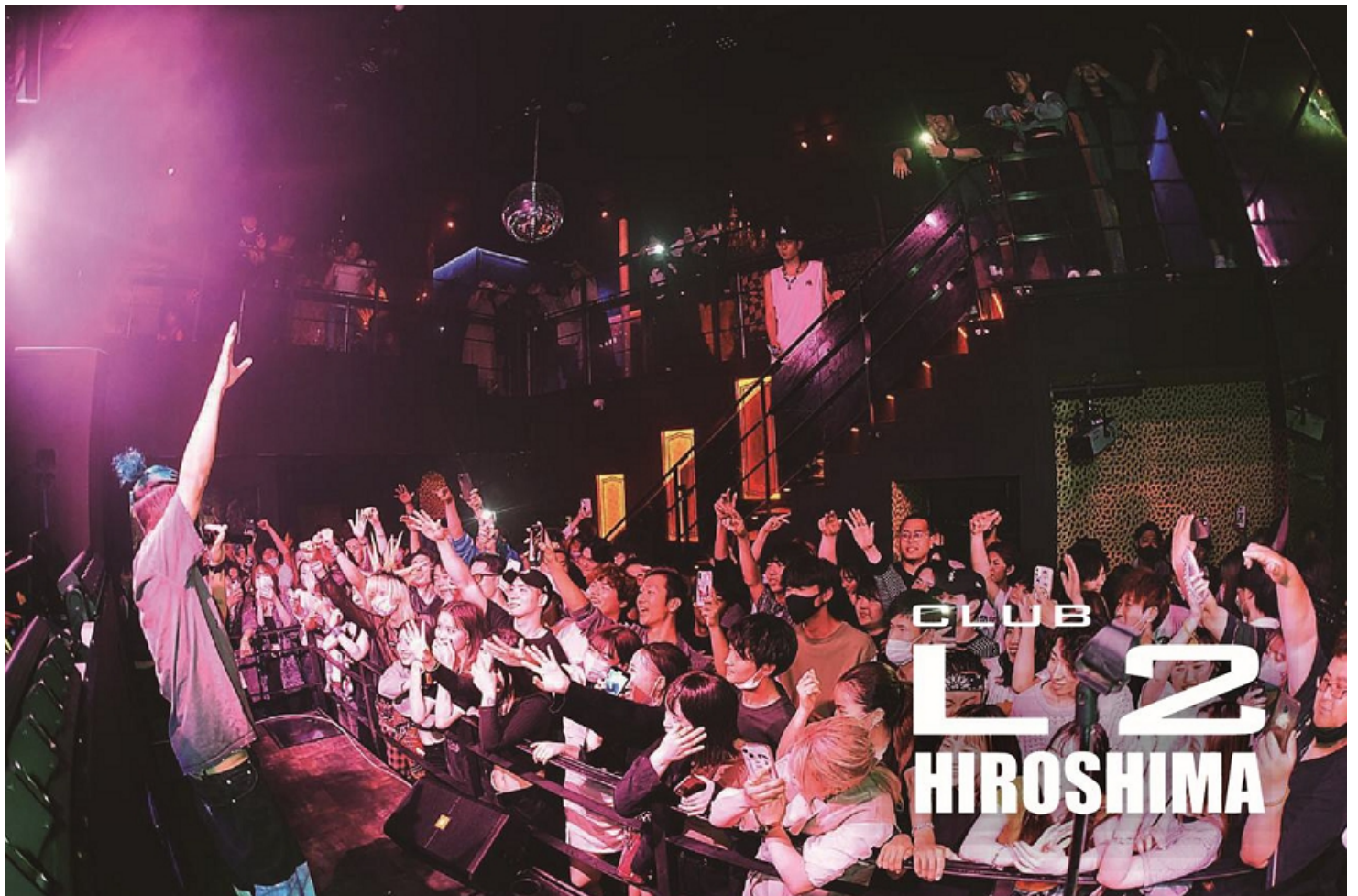
DJ performing at L2 club managed by TryHard in Hiroshima city, Japan