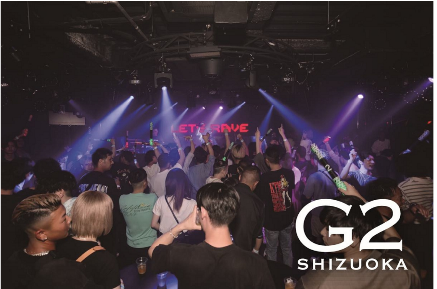
Locals and international tourists enjoying a Friday night at G2 club managed by TryHard in Shizuoka city, Japan