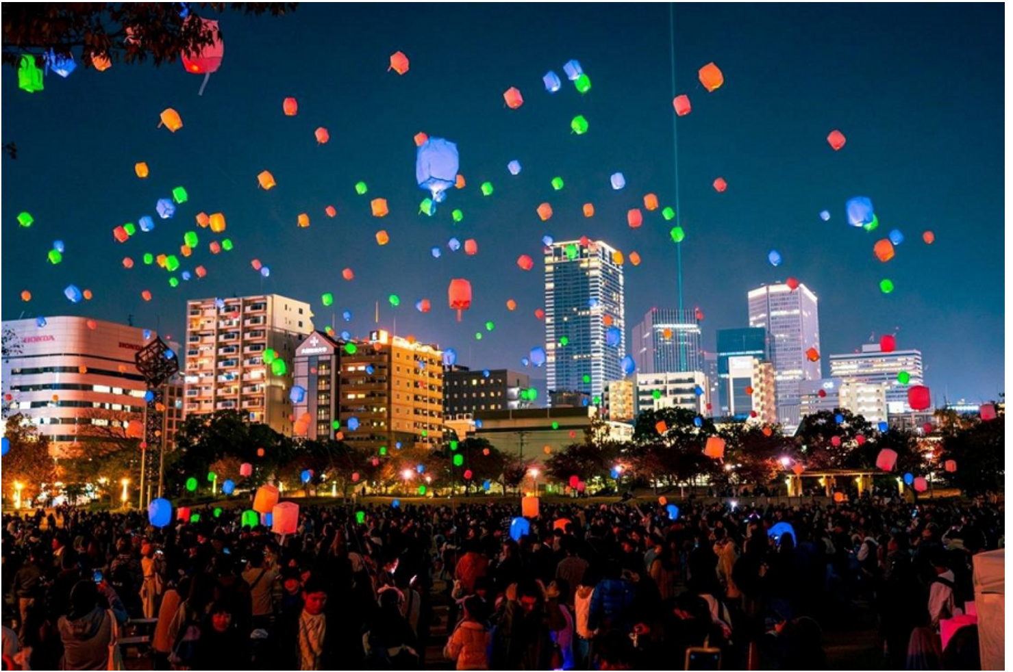
The crowd releasing lanterns at Ogmachi Lantern Festival 2024 organized by TryHard at Ogimachi Park Multipurpose Plaza in Osaka Japan