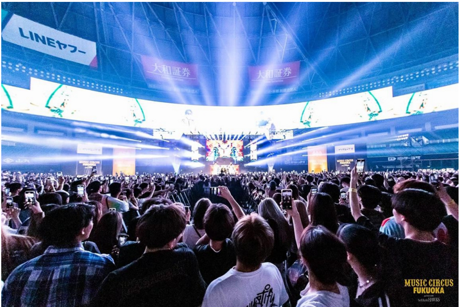
Concert at MUSIC CIRCUS FUKUOKA, the music festival co-held by TryHard and SoftBank HAWKS in June 2024