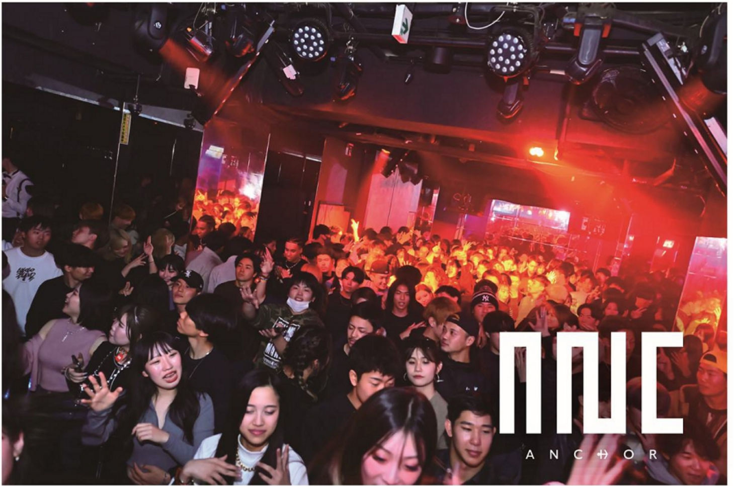
A Sunday night at Anchor club managed by TryHard in Kobe city, Japan