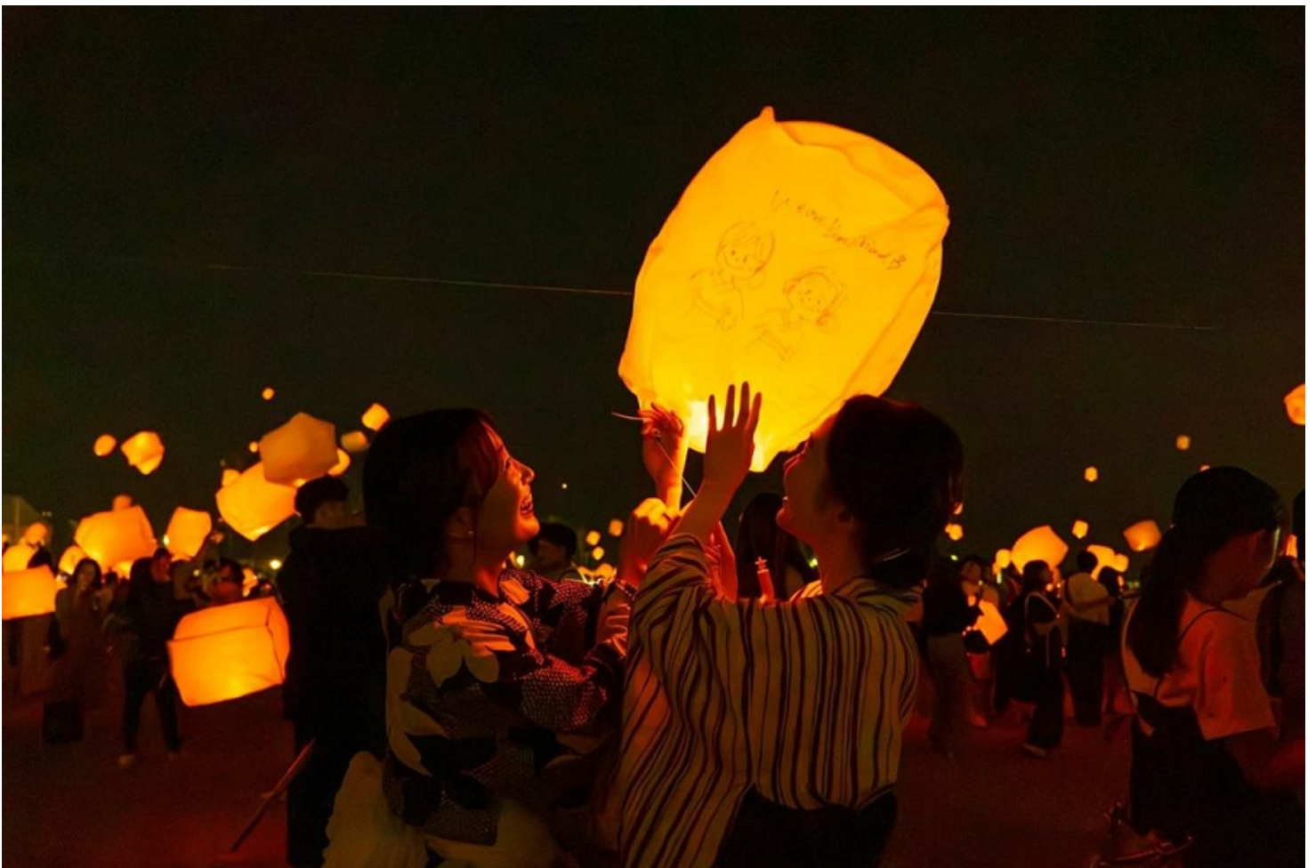
From the Senshu Beach Lantern Festival 2023 organized by TryHard at SENNAN LONG PARK in Sennan city, Osaka Japan