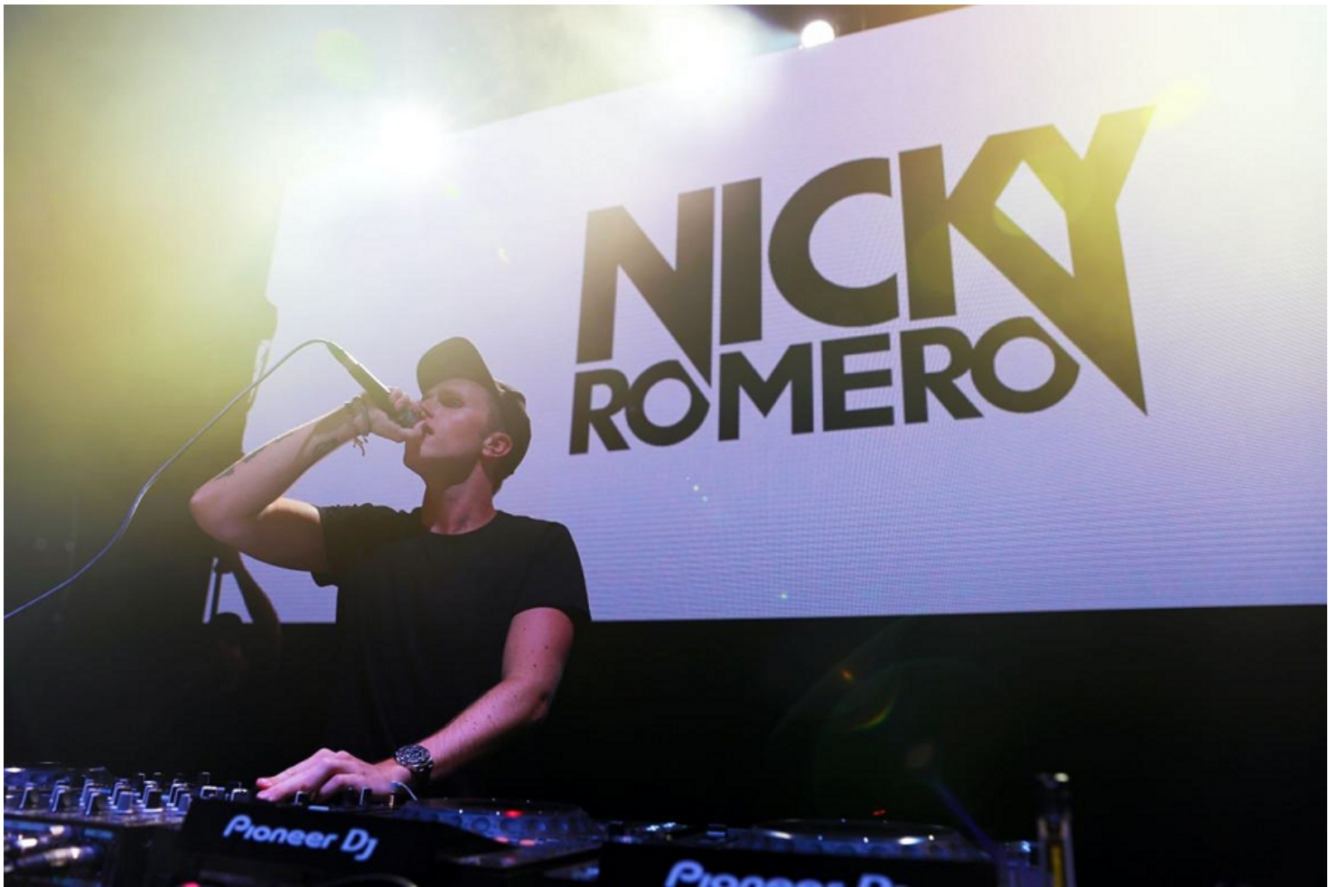
DJ Nicky Romero performing at MUSIC CIRCUS organized by TryHard at Tarui Southern Beach (Rinku Minamihama, Sennan City, Osaka Japan)