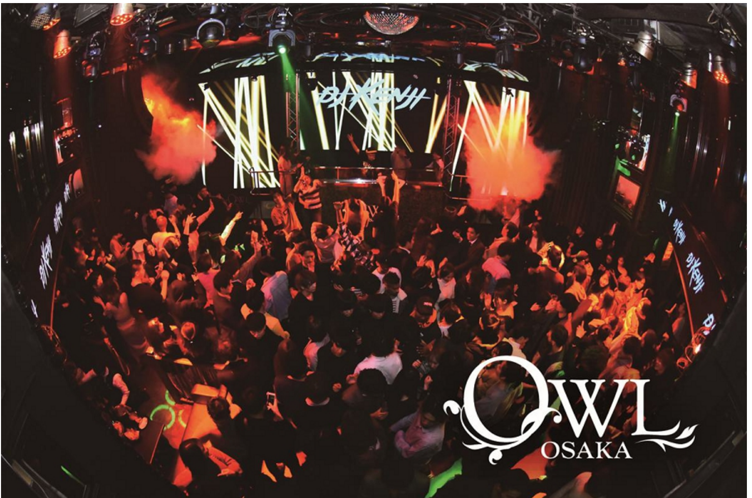
A typical weekday night at Owl club managed by TryHard in Osaka, Japan