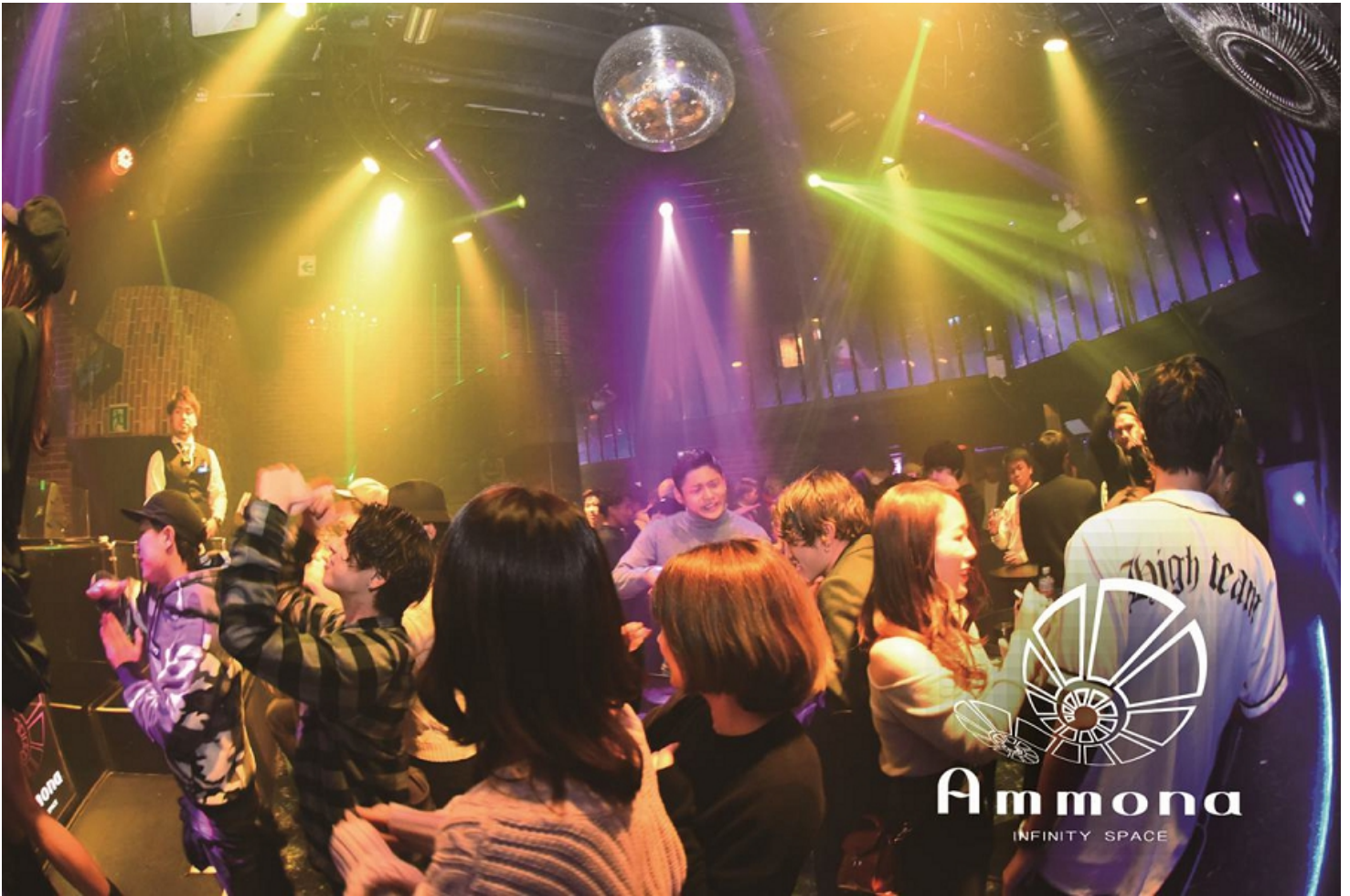
A typical weekday night at Ammona club managed by TryHard in Osaka, Japan