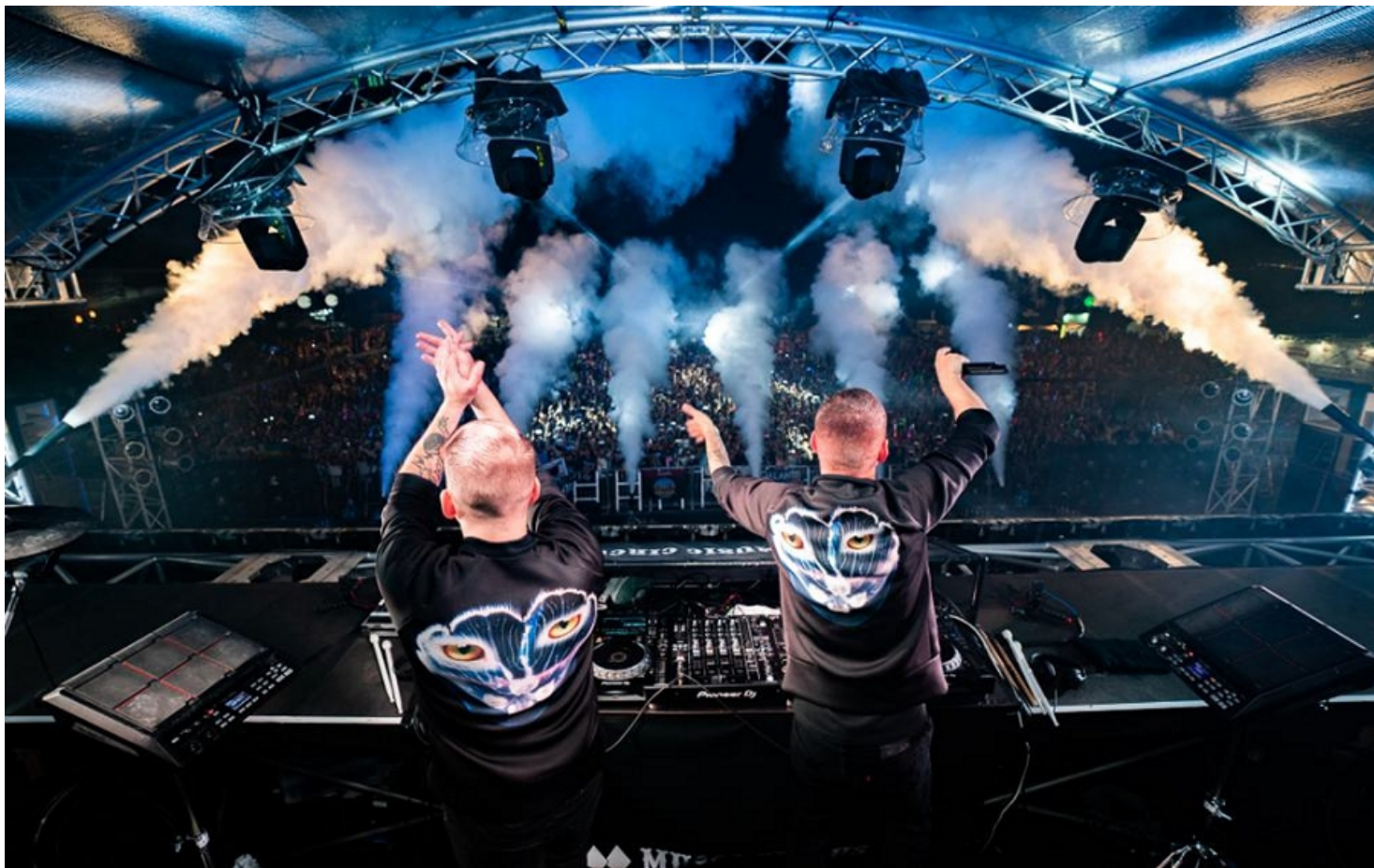
DJs performing at MUSIC CIRCUS organized by TryHard at Tarui Southern Beach, Rinku Minamihama Sennan City in Osaka Japan