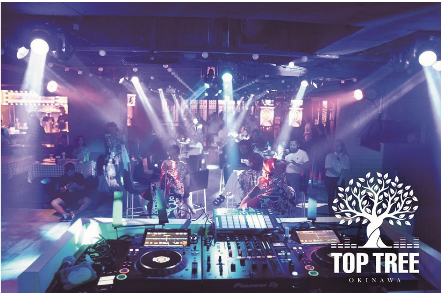
Local artists giving a Japanese cultural performance to the tourists at Top Tree club managed by TryHard in Okinawa city, Japan