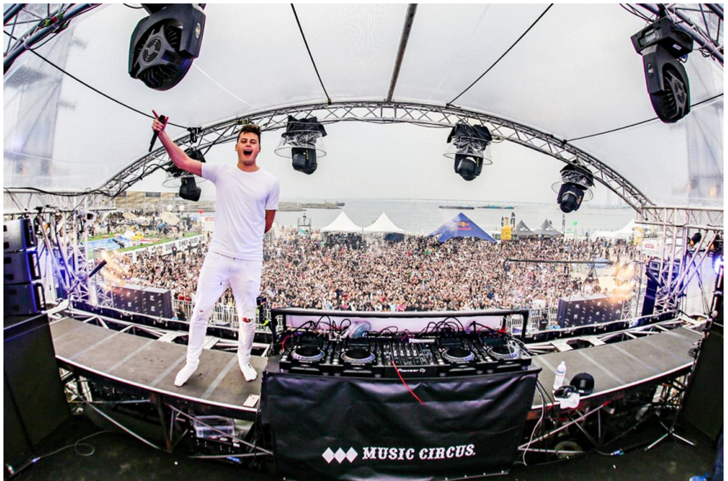
DJ performing at MUSIC CIRCUS organized by TryHard at Tarui Southern Beach (Rinku Minamihama, Sennan City, Osaka Japan)