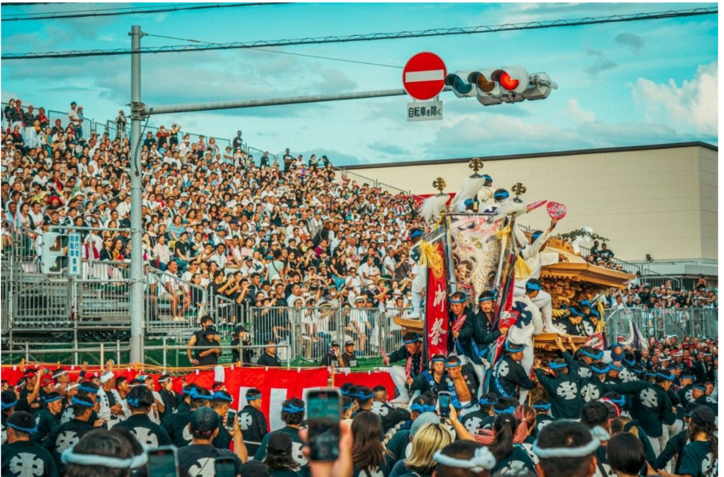
From the Kishiwada Danjiri Festival in September 2024 organized by TryHard in Kishiwada city, Osaka Japan